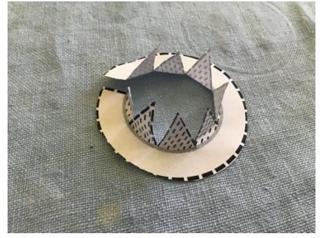
Step 4: Add glue to the triangle flaps and then fold them up to make a crown.