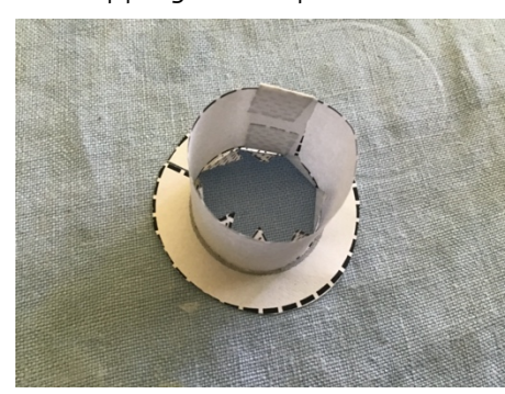
Step 5: Slot the tube on top of the crown piece.