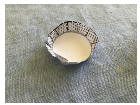
Step 7: Add glue to the petal flaps and then fold them up.