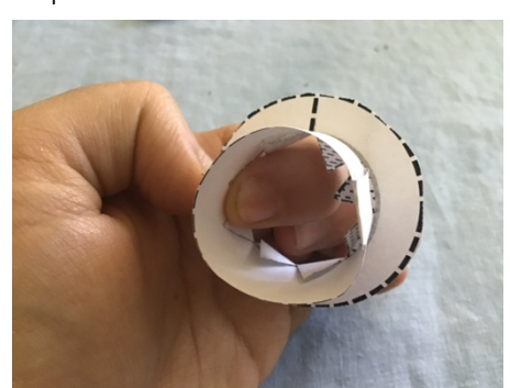
Step 6: Press the triangles into the inside of the tube so they stay in place