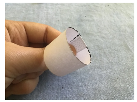
Step 3: Add glue and fold down the two flaps to hold the tube in place.