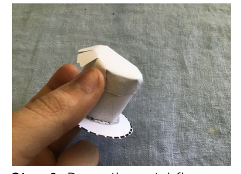
Step 9: Press the petal flaps into the outside of the tube so they stay in place.