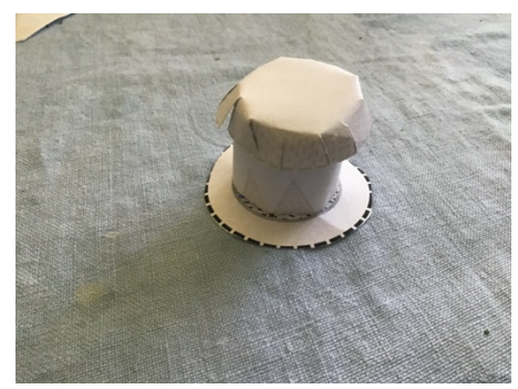
Step 8: Place the piece from the last step on top of the tube.